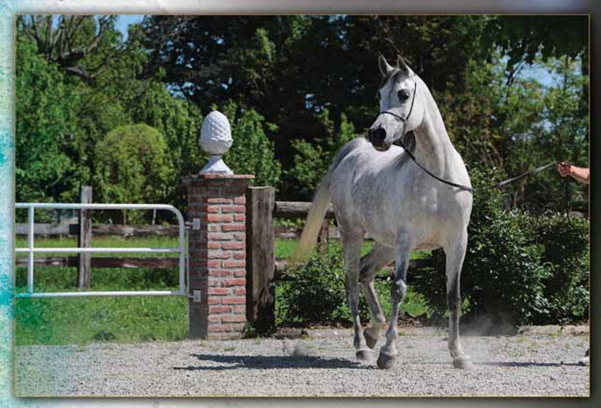
LAHEEBA LE SOLEIL (Alfabia Sheib x Halimashah Le Soleil) 2012 Grey Mare