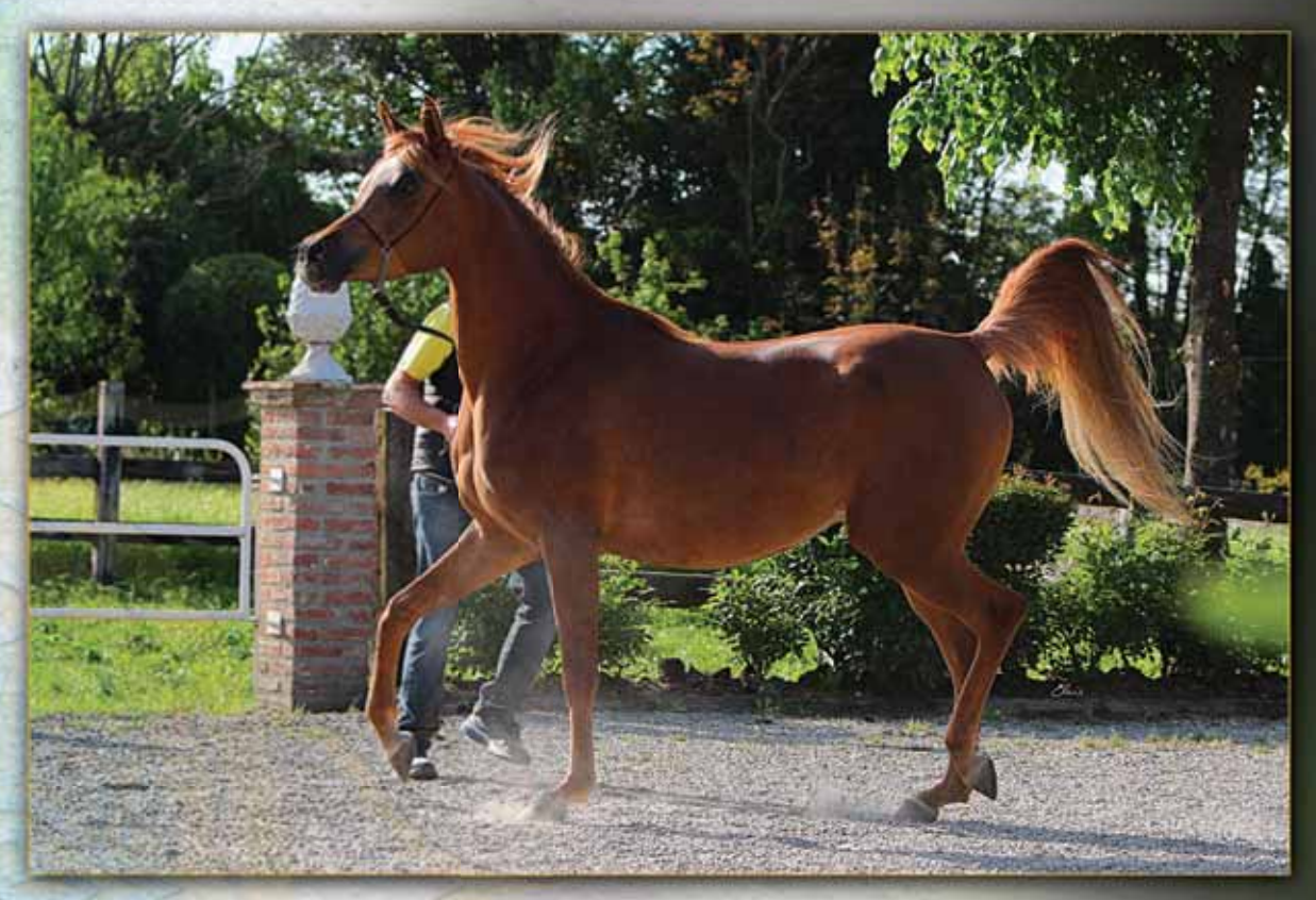
PASSIFLORA LE SOLEIL (ZT Magnofantasy x Laheeba Le Soleil) 2017 Chestnut Mare